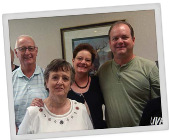
KY PROFESSIONALS COUNCIL - JUNE 2010