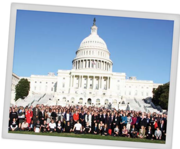
UNITED WAY DAY ON CAPITOL HILL - MARCH 2010

While the legislation did not make it out of committee during 2010 and was not introduced in the short 2011 session, we are hopeful that Representative Glenn will reintroduce it in 2012.